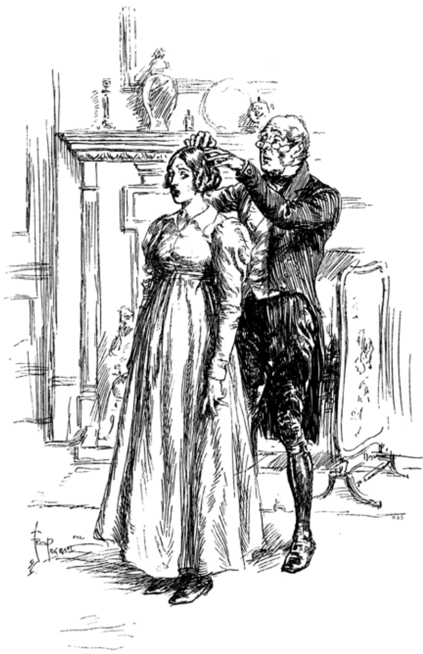
PUTTING HIS FINGERS THROUGH HER HAIR.